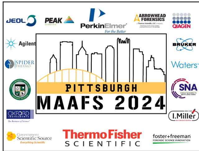
Vendor Sticker Collection Sheets

What interactions with the conference attendees do you find to be the most beneficial?